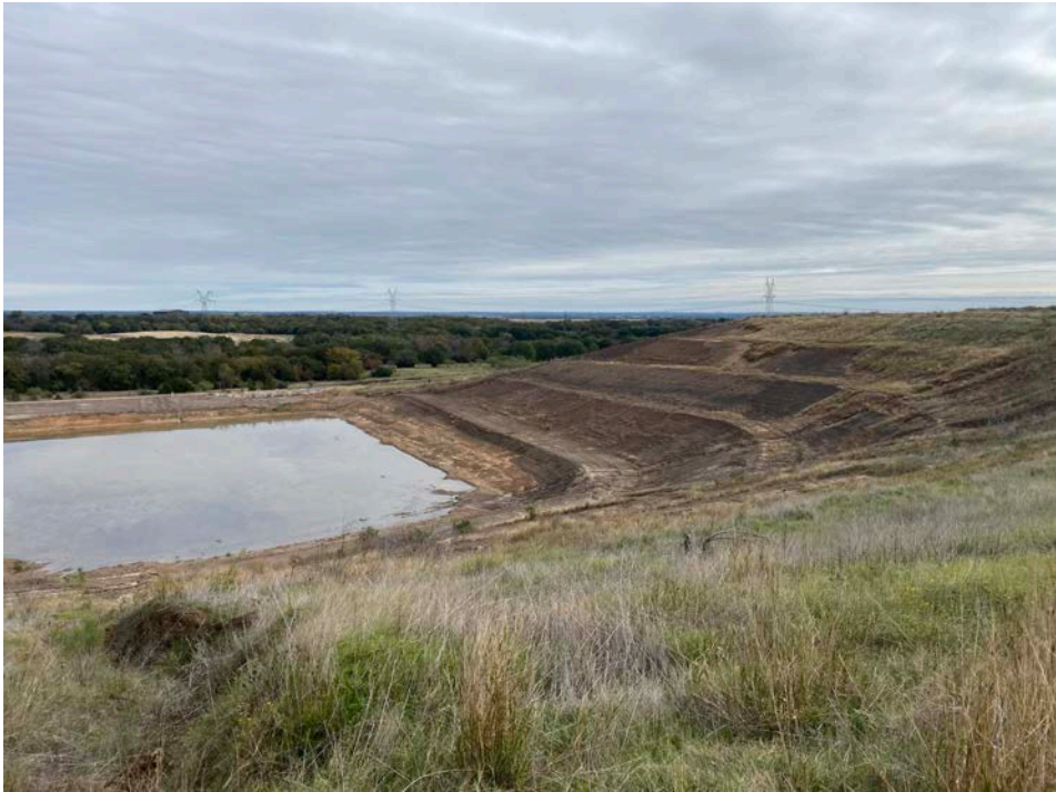
Photo No. 9 – Interior side slopes around Pond 003, view southeast.