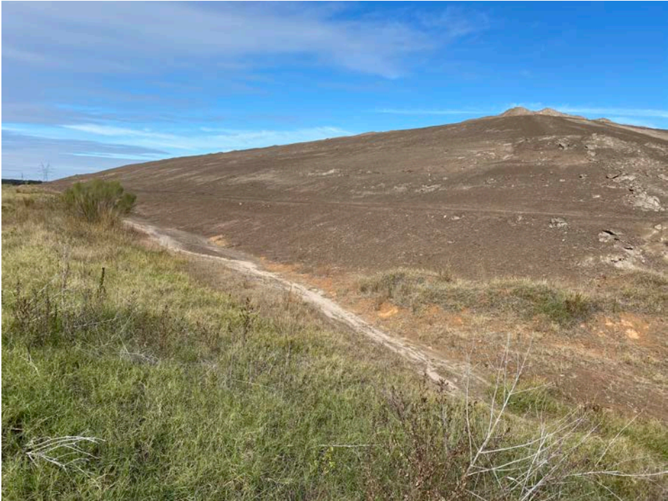
Photo No. 15 – West slope and west perimeter ditch, view northeast